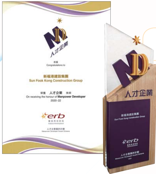
Manpower Developer 人才企業