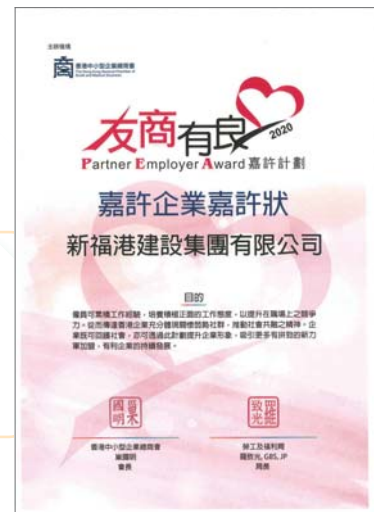
Partner Employer Award 2020 - Certificate of Appreciation (Enterprise) 「友商有良」嘉許計劃 2020 - 嘉許企業嘉許狀