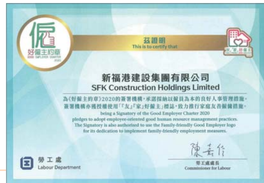
Signatory of the Good Employer Charter 2020 《好僱主約章》2020的簽署機構