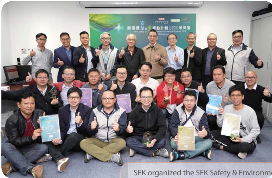
SFK organized the SFK Safety & Environmental Awards Scheme 2019 Award Ceremony 新福港舉辦安全及環保獎勵計劃2019頒獎典禮