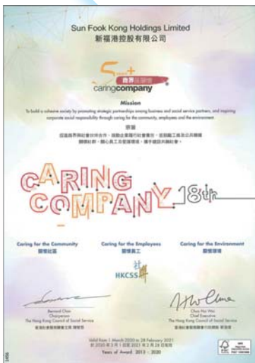
5 years+ Caring Company Logo 連續5年或以上獲頒「商界展關懷」標誌